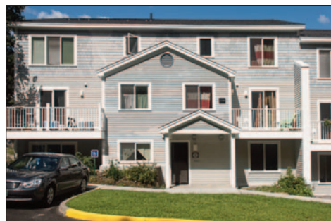
Burlington Land Trust rental housing, Vermont.