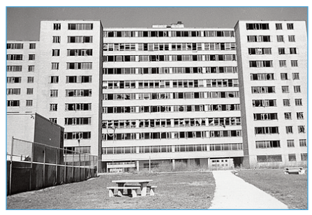
Pruitt-Igoe (St. Louis)