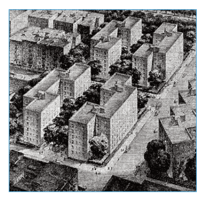
First Houses, NYC-1935

Shelley v. Kraemer (and Hurd v. Hodge): The U.S. Supreme Court holds that courts cannot enforce racially restrictive covenants on real estate.