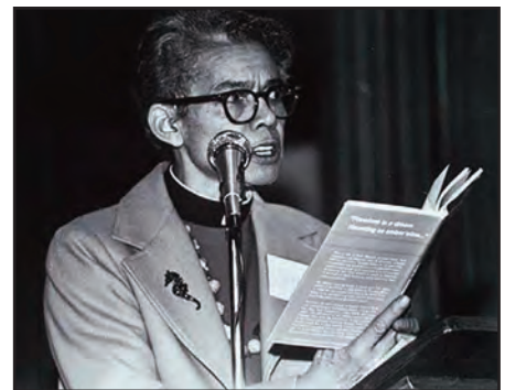
Pauli Murray

In 1944 a Rosenwald fellowship enabled a young Pauli Murray , who had just graduated as valedictorian of her class at Howard University Law School, to continue her