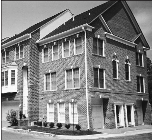
Inclusionary housing (a duplex) in McLean Courts in Fairfax County

families of the Housing Authority of Baltimore City have been aided in moving from low opportunity to high opportunity neighborhoods (89 percent into the city’s suburban counties). 46