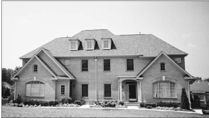
Inclusionary housing (a 4-plex) in the Carrington subdivision in Fairfax County.

Only 58 of 127 IZ ordinances (or 45 percent) explicitly apportion some units for households below 50% AMI and only three cities (Carlsbad, Roseville, and San Marcos, CA) explicitly apportion some units for households below 30% AMI. 39